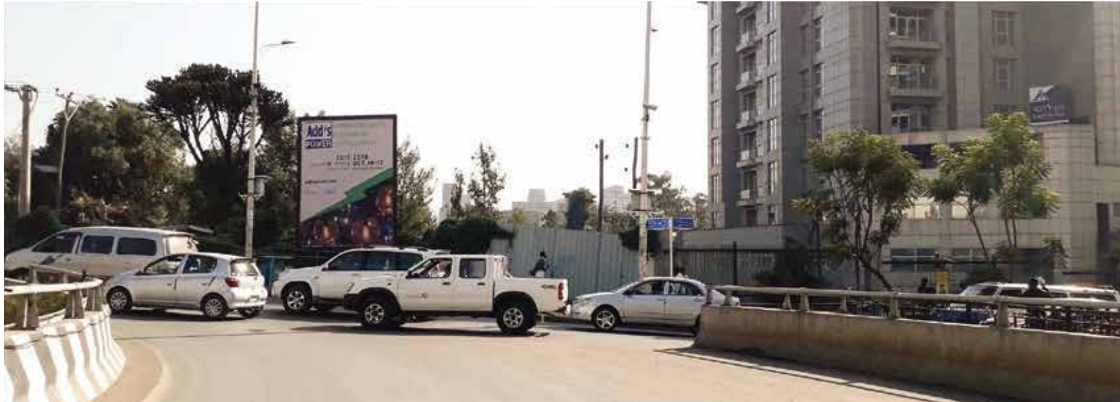
Downtown - 1 Month